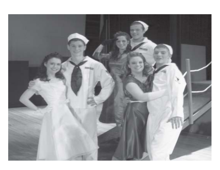
The cast of "On the Town".

About 40 kids worked hard to produce this year's play including actors, stage crewmembers, and musicians in the pit. The kids are not the only ones who put time and effort into the play; many parents